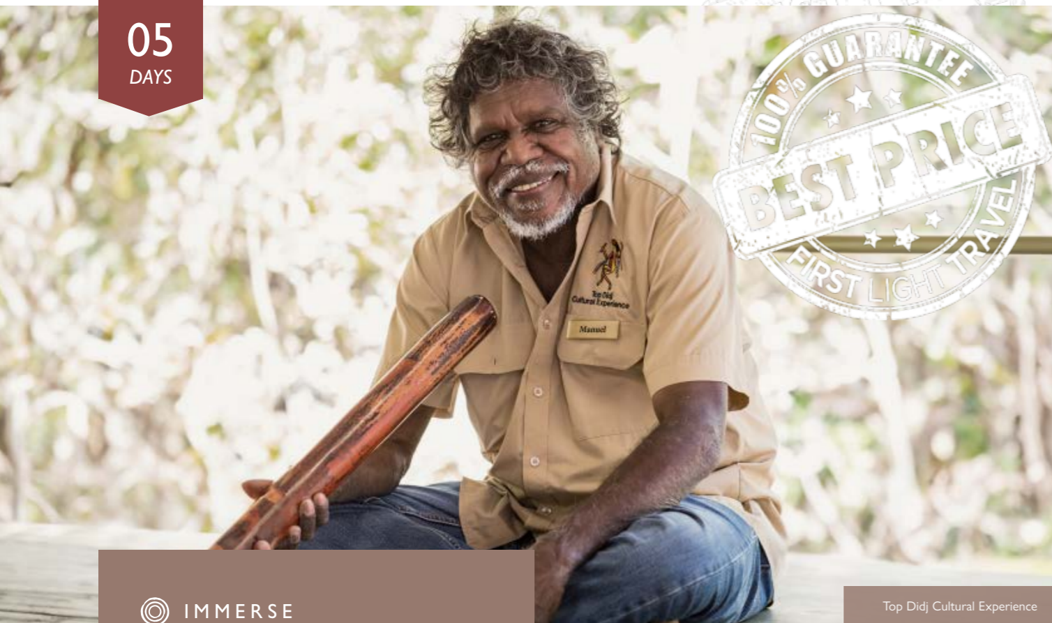
Top Didj Cultural Experience