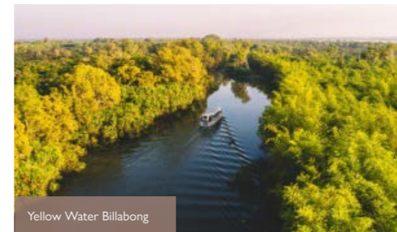
Yellow Water Billabong

MEALS Breakfast, lunch, dinner with wine