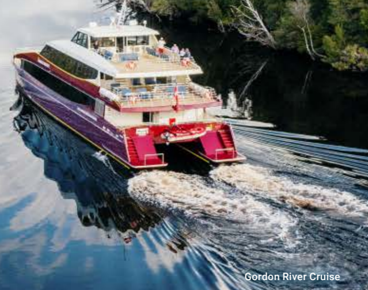
Gordon River Cruise