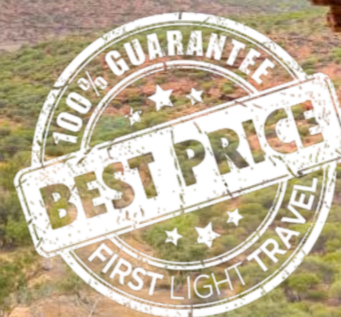
Kalbarri National Park

The colours of Monkey Mia sear into your memory, the turquoise ocean here home to a famously friendly pod of resident dolphins.