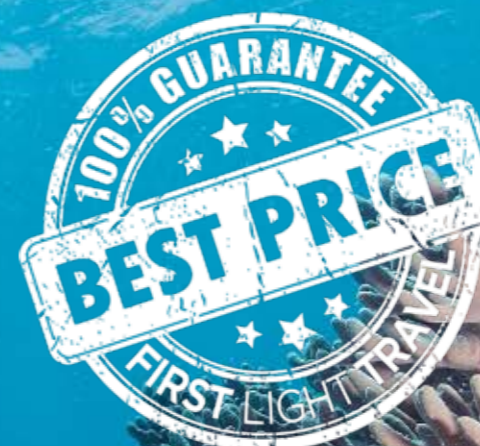
Great Barrier Reef