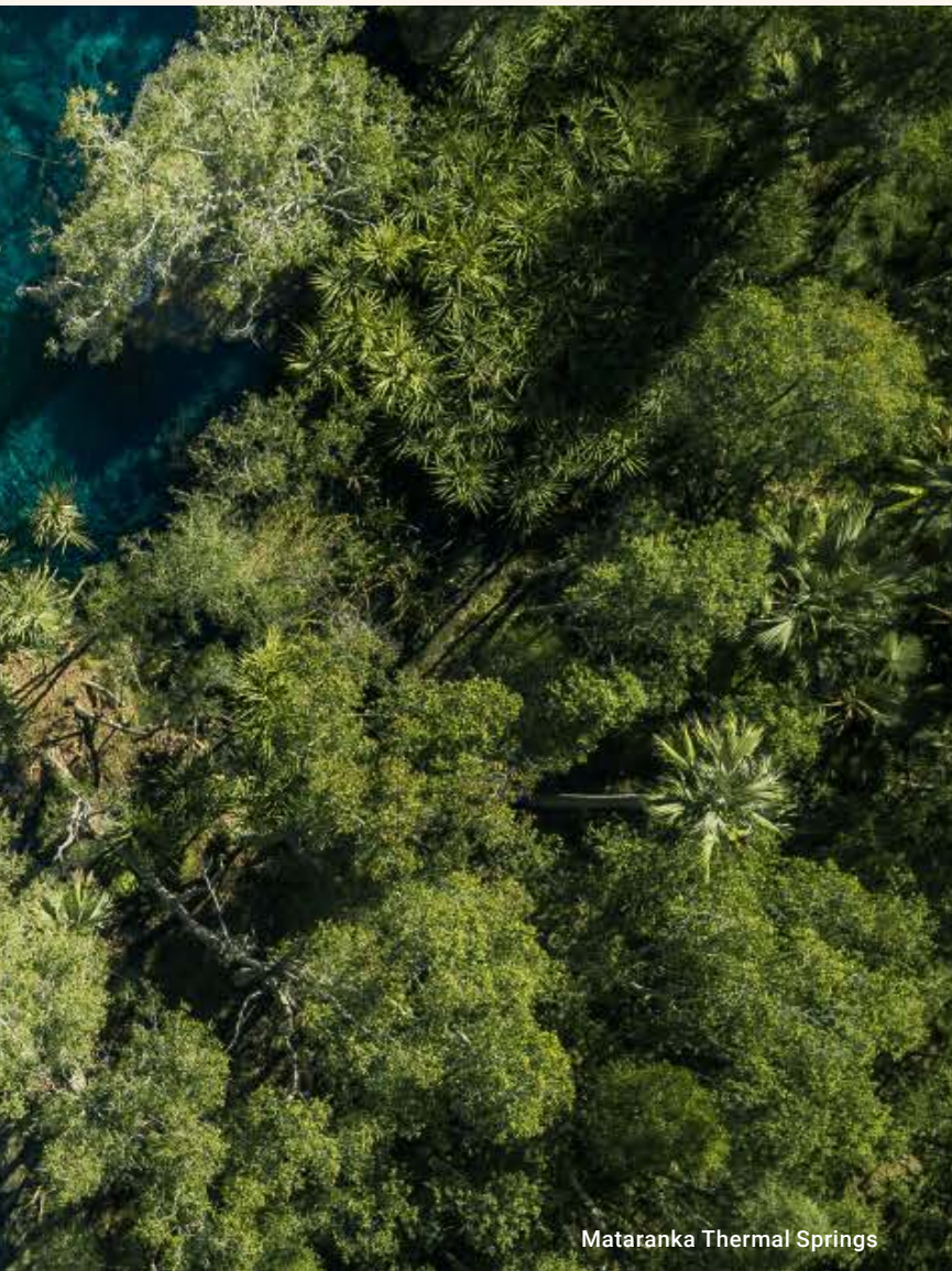
Mataranka Thermal Springs