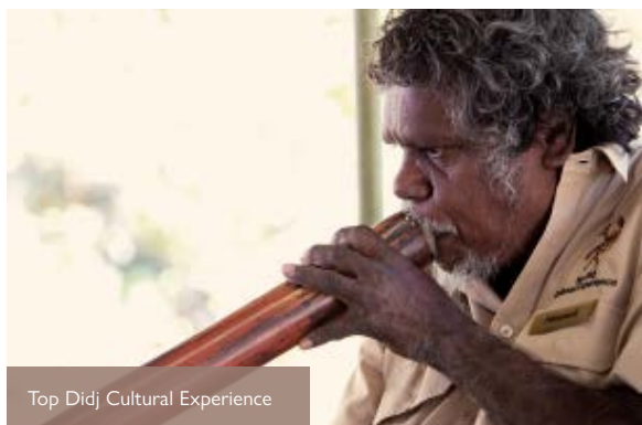
Top Didj Cultural Experience

MEALS Breakfast, lunch, Local Dining Experience